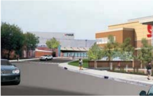
NEW RETAIL VIEW LOOKING SOUTH NEAR UNIVERSITY AVENUE ENTRANCE