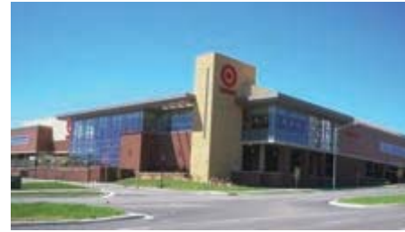
NEW TARGET STORE VIEW FROM UNIVERSITY AVENUE